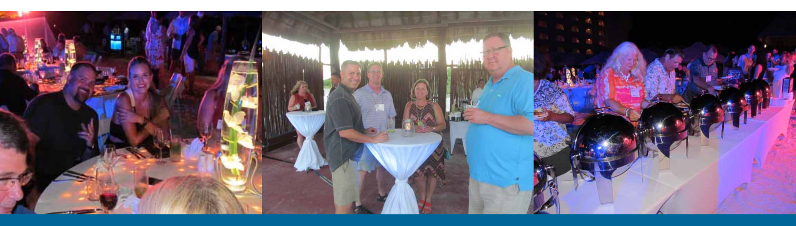
SEAL IN THE SAND BEACH DINNER