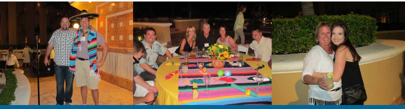
WELCOME RECEPTION & DINNER