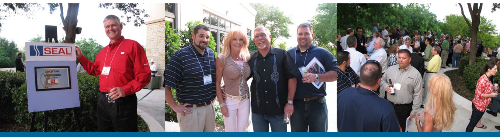
Wednesday Evening Welcome Reception