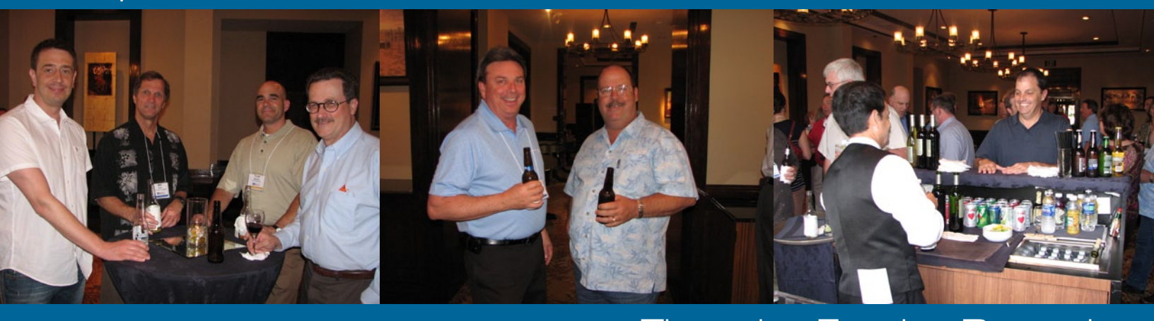
Thursday Evening Reception